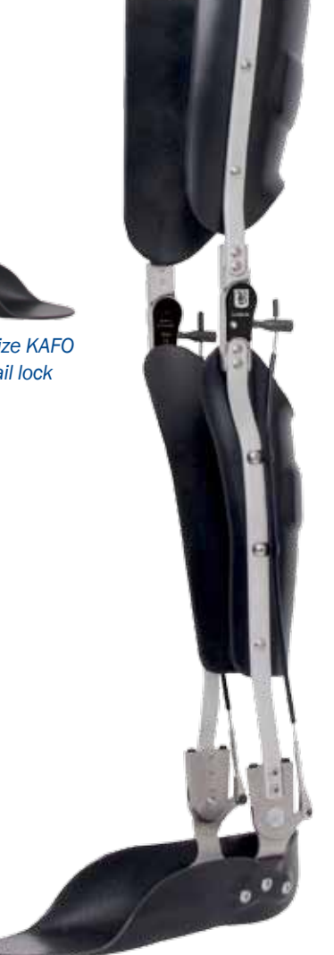
FullStride<sup>™</sup> B Size KAFO in Stance Control configuration with Stance Control stirrup option.