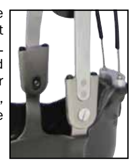
Shown with heel cable receptor.

Note: All FullStride kits come with a heel cable receptor that is thermoformed into the UCBL during fabrication. If you would prefer to use a standard stirrup, or stirrup inserts with your FullStride, please refer to page 17 for available options.